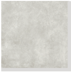
Cool White (H001)