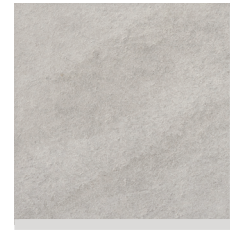
Stone Light (H014) 💧