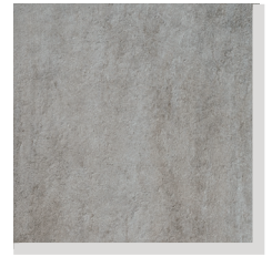
Silver Stone (H015) 💧