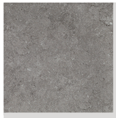
Greige Stone (H016) 💧