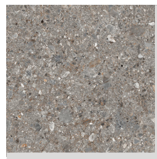
Grey Venture (VE015)