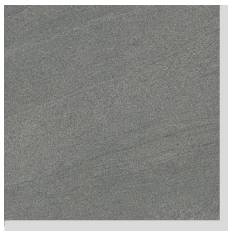
Greystone (H006) 💧