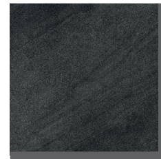
Bluestone (H007) 💧