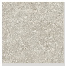
Beige Venture (VE014)