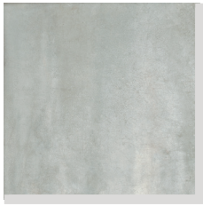
Cool Grey (H013)